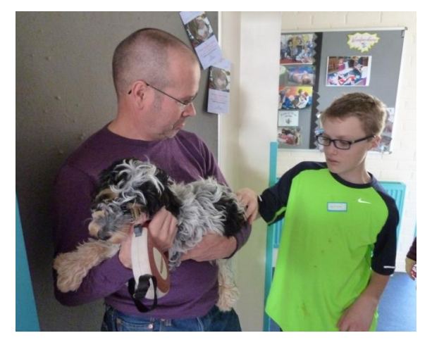
Look at the difference in his confidence in the 2 photos here.